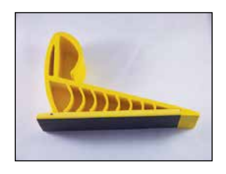
NON-SKID DOOR STOP

Size: 6" long x 1.5" wide x 1.75" high to top of ramp. 3.75" high to top of hook.