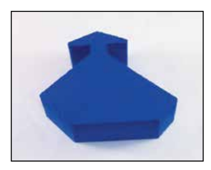
DOOR STOP - BLUE FOAM

Typical applications: floor maintenance, cleaning, moving and air circulation.